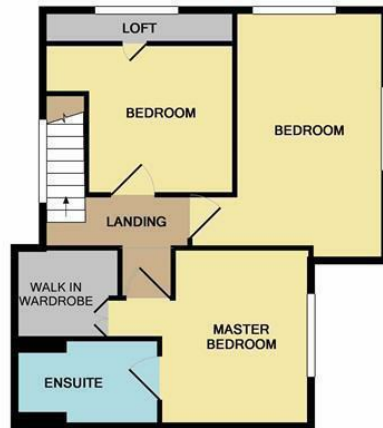
1ST FLOOR APPROX. FLOOR AREA 529 SQ.FT. (49.1 SQ.M.)